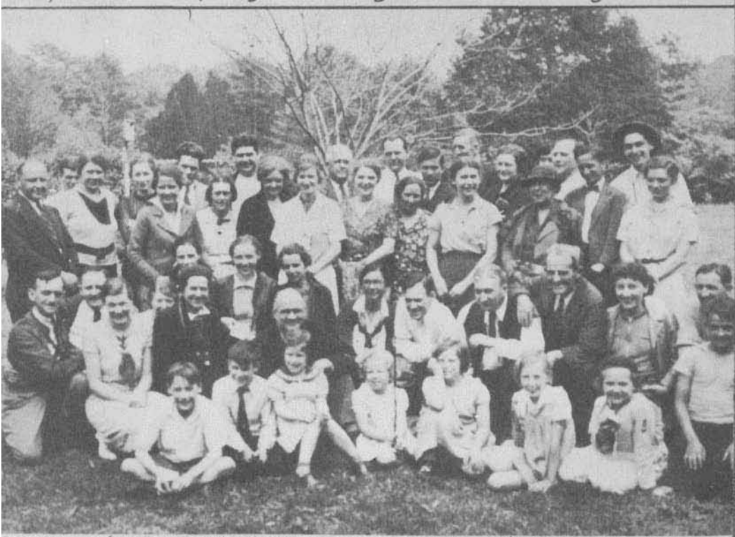
Group at Knoxville T.O.S. Annual Spring Bird Census. May 3.