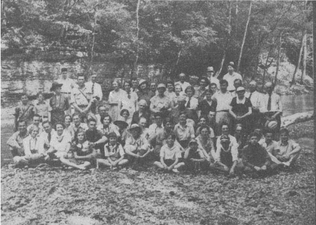
Group at Annual Spring Field Day , Nashville . May 10,1936