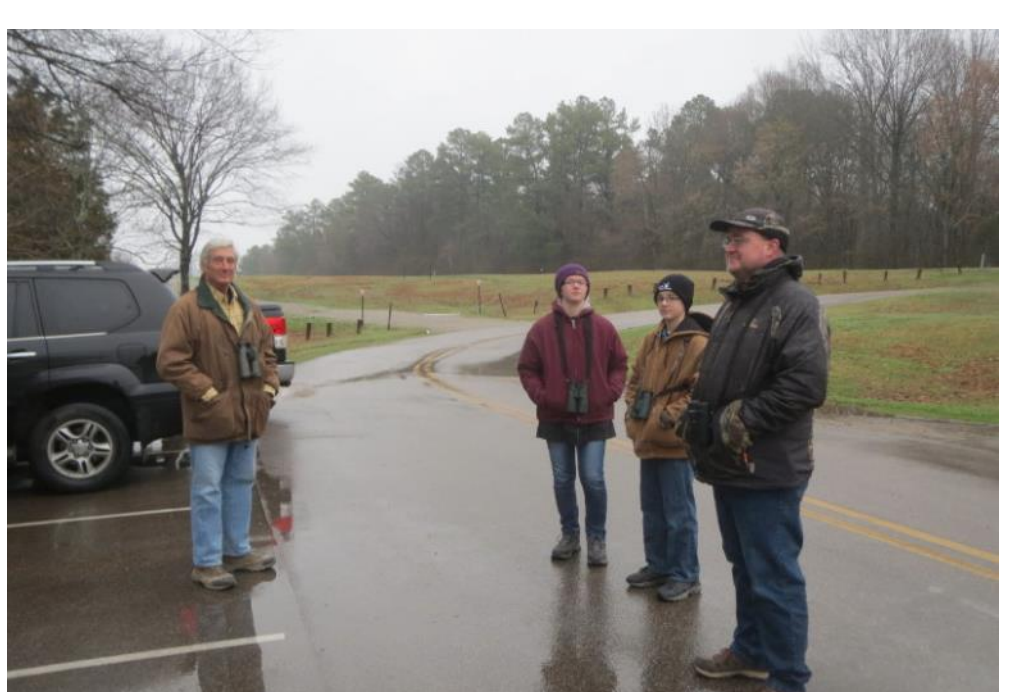
Five of us waiting in the rain for the other 150+ members of the club to show up for the Saturday outing at Shelby Farms. Which, by the way, turned out to be a pretty productive bird watch.

Shelby Farms Feb 23 MTOS Field Trip <a href="https://ebird.org/tripreport/110324">https://ebird.org/tripreport/110324</a>