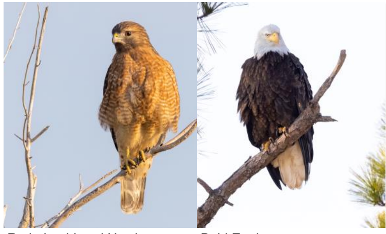
Red-shouldered Hawk Bald Eagle