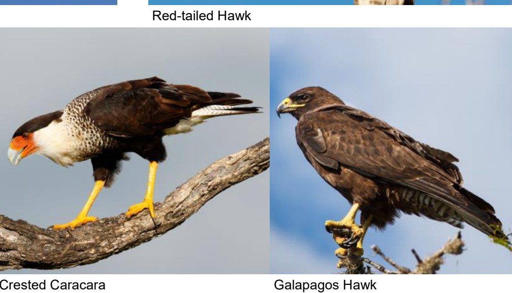
Roadside Hawk Crested Caracara