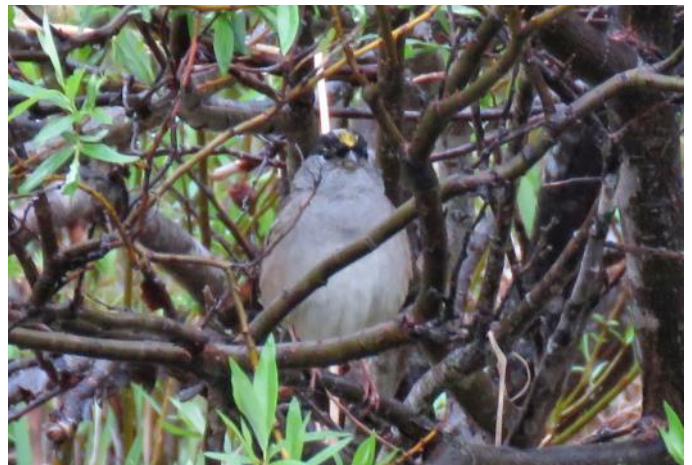
Golden-crowned Sparrow Summit Lake