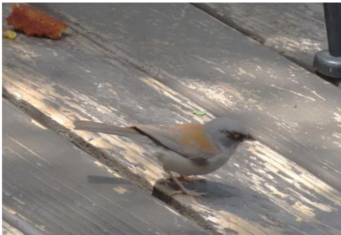
Yellow-eyed Junco Mount Lemmon