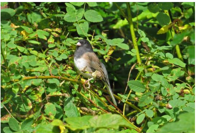
Dark-eyed Junco (Oregon) Northwest Trek