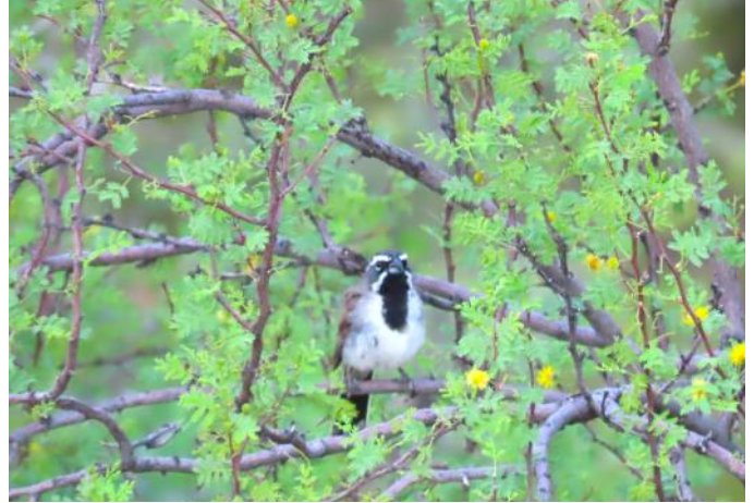
Black-throated Sparrow Saguaro National Park