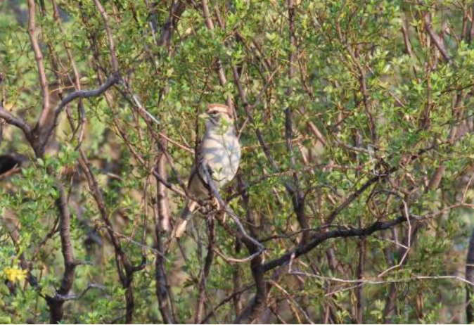
Rufous-winged Sparrow Saguaro National Park