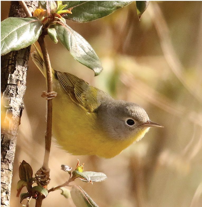
Figure 1. Nashville Warbler at Riverfront Park, Kingsport, Tennessee, on 9 February 2019.

Although the microclimate in the riparian strip had a concentrating effect, what brought this assemblage of warblers to northeast Tennessee in midwinter? Had they been present at this site or in the vicinity earlier in the winter? Were they late autumn holdovers, like the surprising number of lingering Neotropical migrants seen during November 2018 in East Tennessee (Knight 2019a)? There were no obvious weather anomalies that might account for the presence of these warblers in late January.