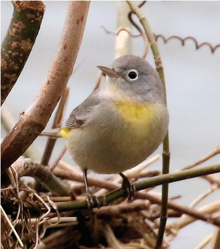
Figure 1. Virginia's Warbler in Kingsport, Tennessee, 26 January 2019.

even dropping to the ground to forage in short grass. During its stay the Virginia's Warbler sometimes loosely associated with a mixed flock of other warblers and Ruby-crowned Kinglets ( Regulus calendula ), but it often stayed by itself. Occasionally it was chased by Yellow-rumped Warblers ( Setophaga coronata ). The Virginia's Warbler was seen through 2 February 2019 by an estimated 150+ birders. Additional photos are available at eBird. This warbler endured sub-freezing temperatures overnight several times in January, plus light snowfall on 29 January. On colder days it was more reliably seen close to the water's edge taking advantage of the milder microclimate there. It appeared to be foraging successfully, even on the coldest days. This sighting of Virginia's Warbler represents the first record for Tennessee, pending acceptance by the Tennessee Bird Records Committee.