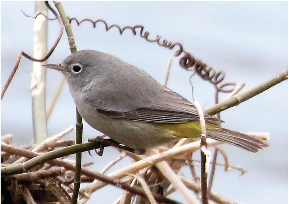
Figure 2. Dorsal view of Virginia's Warbler in Kingsport, Tennessee.

14 states or Canadian provinces east of the Mississippi River, plus one from the Bahamas (Dunn and Garrett 1997, seasonal summaries in North American Birds 1997-2018). The ones nearest to Tennessee were from West Virginia, Georgia, and Alabama. Thus, the sighting in Tennessee is remarkable.