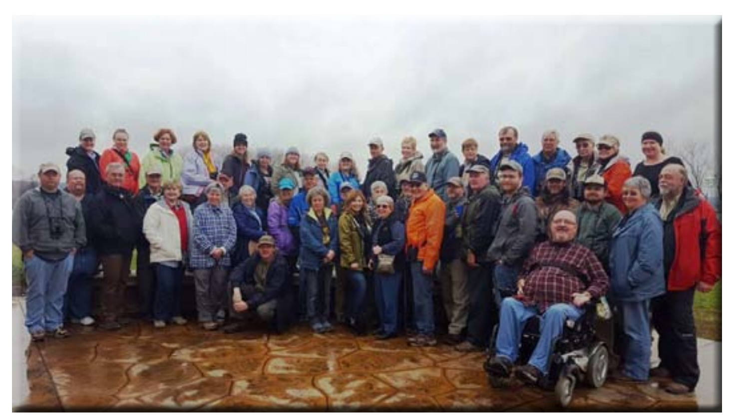
Group photo of all those in attendance at the TOS Winter Meeting at Paris Landing State Park.