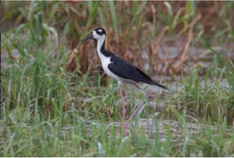
After nesting at Earth Complex, this Black-necked Stilt was ready to head south for winter.