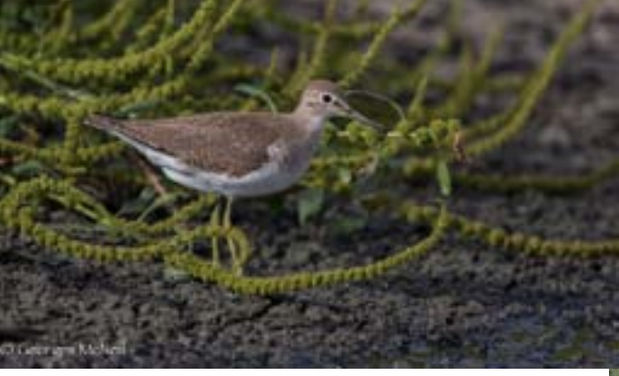
Solitary Sandpiper making a brief migration stopover.