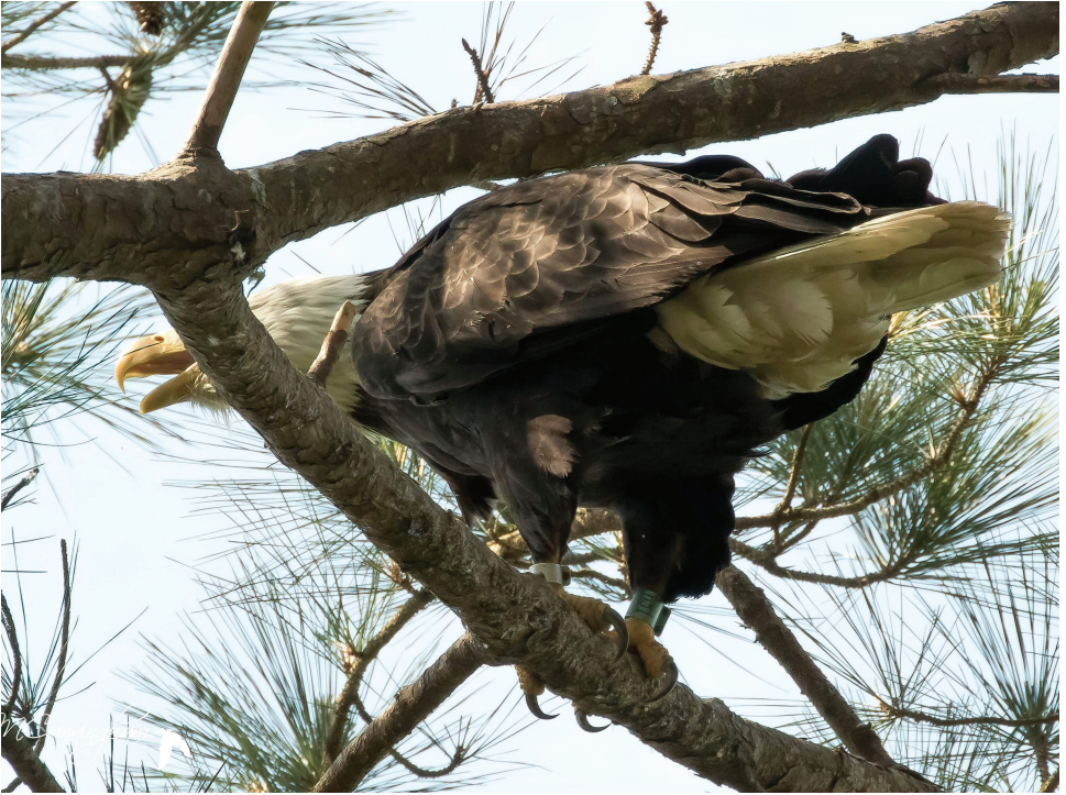
Figure 1. An adult Bald Eagle with leg bands was observed at Clay Bay, Stewart County, Tennessee in May 2019.