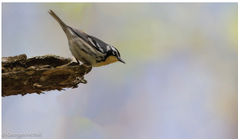
Yellow-throated Warbler ( Setophaga dominica ), Fayette County, Tennessee.

Editor's Note: The Migrant will start to include a Photo Gallery at the end of some issues, as opportunity and space in the issue allows. The submission of photos is open to anyone. Photos should be of Tennessee birds and the picture taken in Tennessee. Relevant field marks should be easily seen in the picture. Pictures that include native habitats and plants are preferred but not required. The name of the bird and the name of the photographer and county are required. Those interested can submit one or multiple pictures to editorthemigrant@gmail.com .