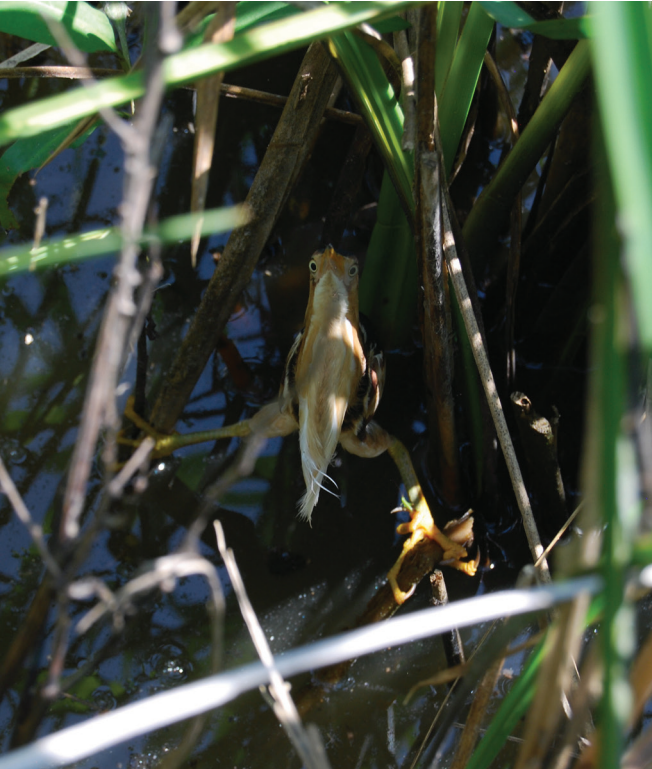
Figure 3. Least Bitterns are secretive marsh birds and were most often detected by flushing or observation deep in vegetation.

Although the occupied marsh site was small, approximately 2.3 acre (approximately 1 ha), the density of Least Bittern nests was quite high at 2.0 nests per acre (5 nests per ha). Least Bitterns are not typically colonial nesting species (Figure 3); nests are not in close proximity (Poole et al. 2009), and nest densities are typically <1 nest per acre (Kushlan 1973, Poole et al. 2009). Higher densities of nests have been reported when habitat conditions are apparently optimal for the species. Densities of 1.2-6.1 nests per acre (1-15 nests per ha) have been reported in Iowa (Kent 1951, Palmer 1962, Weller and Spatcher 1965), 1.2 to 4.9 nests per acre (3-12 nests per ha) in South Carolina (Post 1998), and an exception of 171 nests per acre in an extreme situation in Florida (Kushlan 1973).