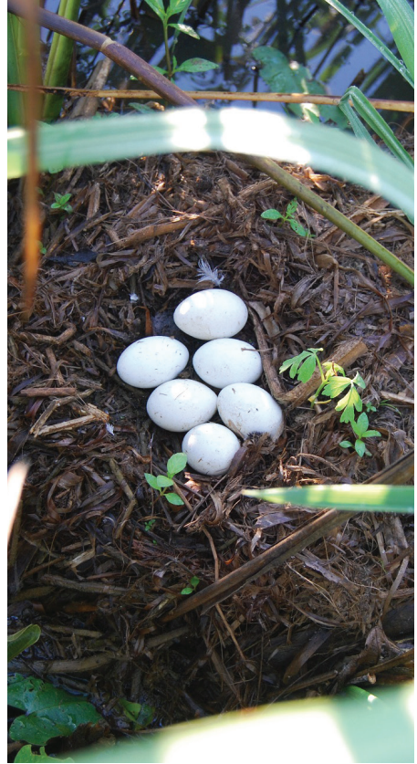
Figure 2. Pied-billed Grebe nest in relatively small numbers across Tennessee; this nest with 6 eggs was documented at Black Bayou Refuge, Lake County, Tennessee.