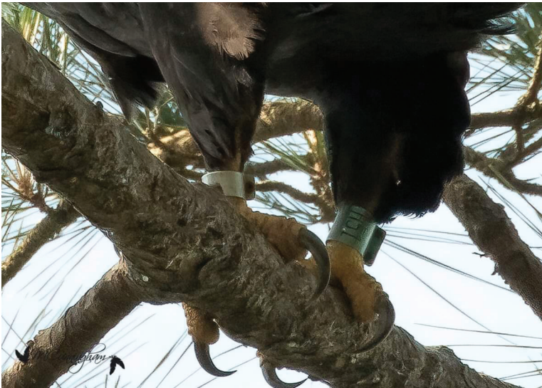
Figure 2. Close inspection revealed the bands on the Bald Eagle at Clay Bay had the number H51, enabling the discovery of the bird's history.