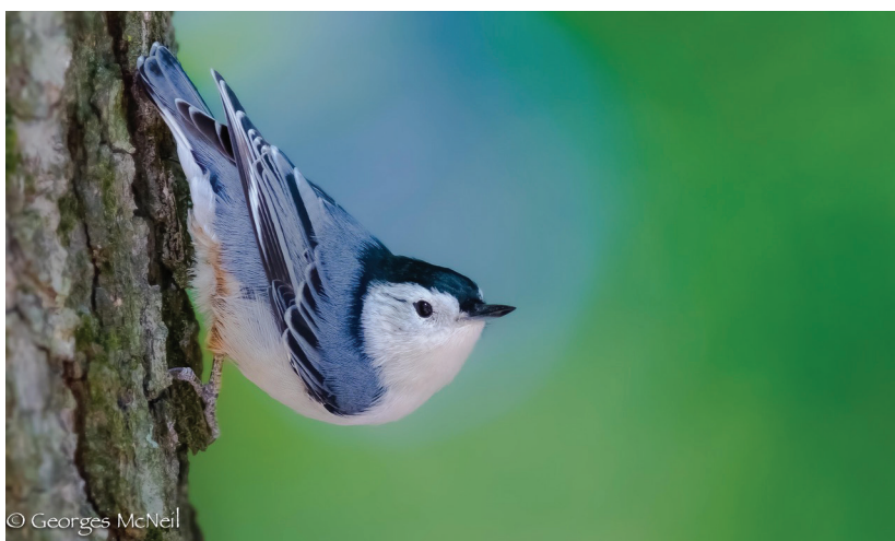
White-breasted Nuthatch ( Sitta carolinensis ), Shelby County, Tennessee.