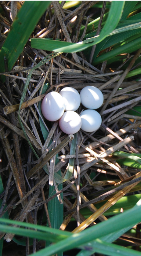
Figure 1. A Least Bittern nest discovered at Black Bayou Refuge, Lake County, Tennessee.