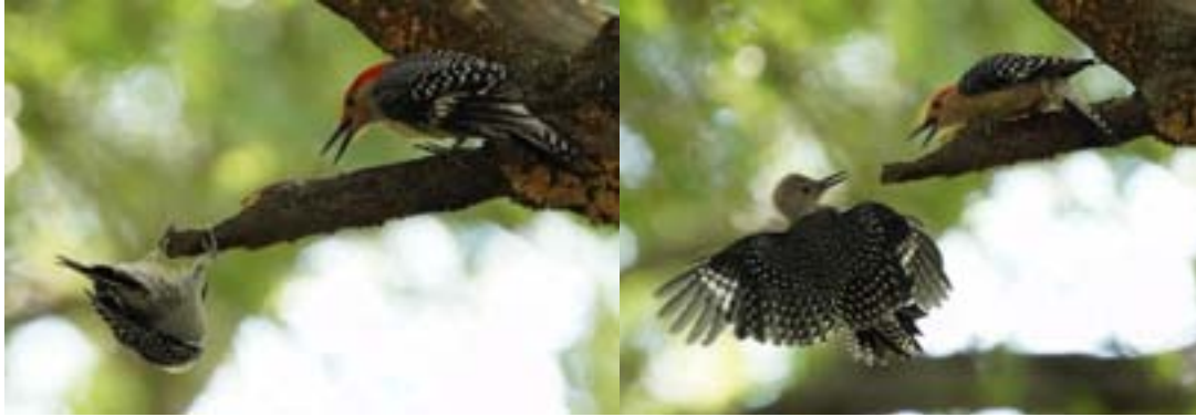
Adult chased fledgling to the edge until it fell off (left to right)

One day, an interesting event occurred at the feeders that intensified my interest. One fledgling was having a snack at a platform feeder when a juvenile jay landed opposite the woodpecker. The jay did not seem to