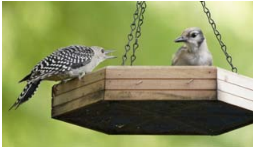
Fledgling aggression at platform feeder

of the fledgling woodpecker with his father. Perhaps the jay came from a "peaceful family" in which its parents were not aggressive or mean towards it, and the woodpecker simply picked up its father's habits. In any case, I was very intrigued with all this unusual behavior, and decided to do some research. I immediately found an article summarizing a study in which female Nazca boobies attacked unrelated young. 1 These abused young, sadly, grew up to be bullies themselves. Another article mentioned feather plucking behavior in cockatiels (a parent plucks its chick's feathers at a dangerously young age), and as with the boobies, the abused cockatiel chicks grow up to become feather-pluckers. 2 I was amazed to find how much these behaviors resembles bullying and child abuse in people.