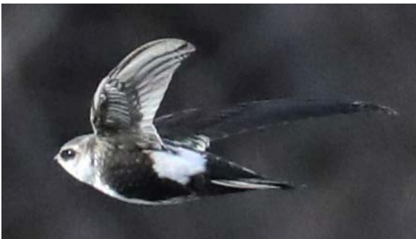
Figure 1. Among the first pictures used to identify this species as a White-throated Swift, observed in Hamilton County Tennessee.

I showed the bird to two others birding nearby, and we discussed the possibility of Tree Swallow ( Tachycineta bicolor ). We dismissed that possibility because the speed of this bird was faster than a Tree Swallow, and I couldn't detect the distinct blue color characteristic of most Tree Swallows. I took a few blurry pictures of the bird in flight and went back to my vehicle to download and attempt to identify (Figure 1).