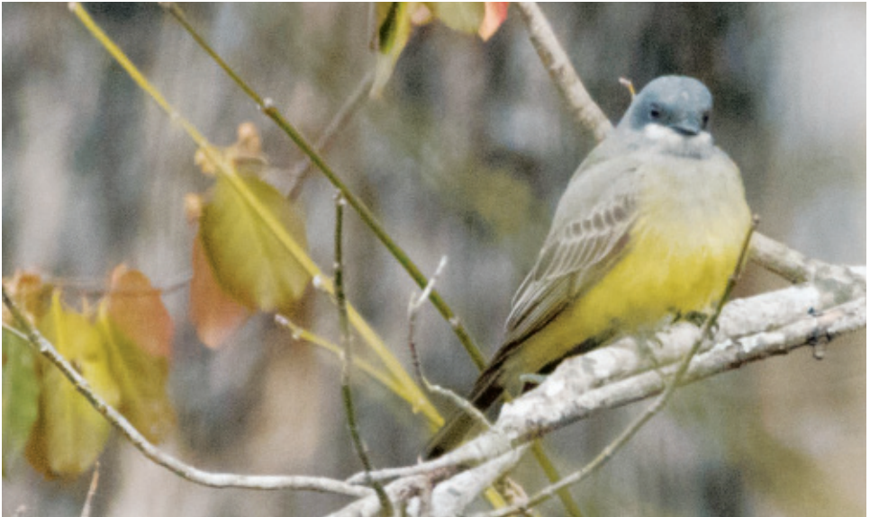
Figure 1. The lemon yellow body and the dark head and chest contrasting with a white throat confirm this bird as Tennessee's first record of Cassin's Kingbird.

On 6 December 2020 while birding at Bells Bend Park, Davidson County, I observed a bird of a species unknown to me. My first impression was a distinct shade of yellow on the breast as the bird flew out of the grass and landed above my head on a utility line (Figure 1). It caught my attention as there was no bird activity in the area at this time. The behavior of the bird was typical of a flycatcher; it flew from the utility line, up to catch an insect, and then back to the utility line, and repeated this behavior several times (Figure 2). The tail was flicking as well. I took a photo and sent the image to Lise Brown who is an avid birder. Lise suggested this could be a Cassin's Kingbird ( Tyrannus vociferans ); based on the same photo, Graham Gerdeman confirmed the bird as such.