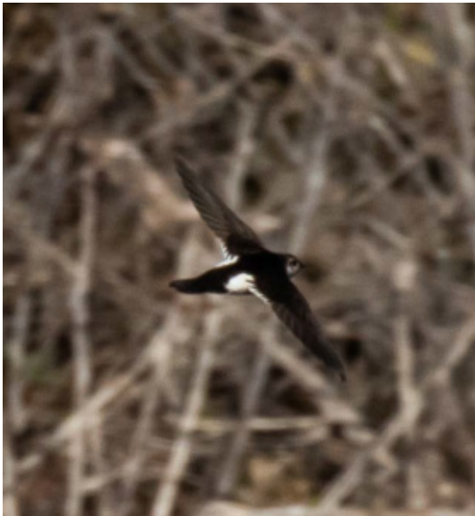
Figure 2. Many people were able to observe the bird the next several days, further verifying field marks for White-throated Swift.

We based our identification on field marks including the white underbelly that started at the throat and continued almost to the tail. The dark underside of the wing colorization extended down the Swift's side, narrowing up the white belly and appeared to give it large sized white rounded marking on the sides of its rump (Figure 2). The bird's flight also helped confirm the identification: White-throated Swifts are among the most accomplished fliers of all North American birds, streaking forward at high speed, then suddenly changing direction with lightning-fast adjustments of wing and tail (Figure 3). The generic name of this species is particularly apt: Aeronautes , or "sky sailor." (eBird 2021).