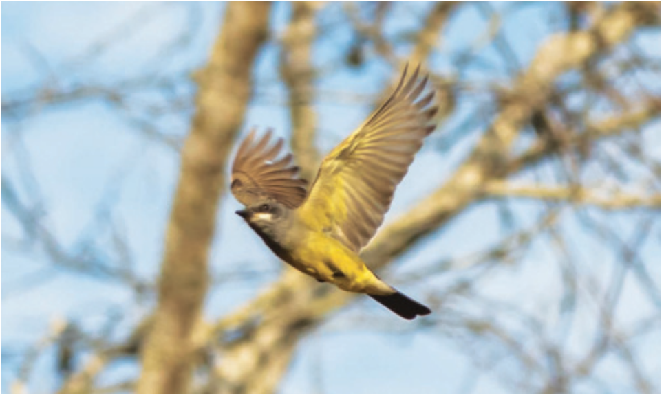
Figure 2. This Cassin's Kingbird exhibited typical flycatcher behavior, often perching in the open, changing perches to nearby areas occasionally, and flycatching insects.