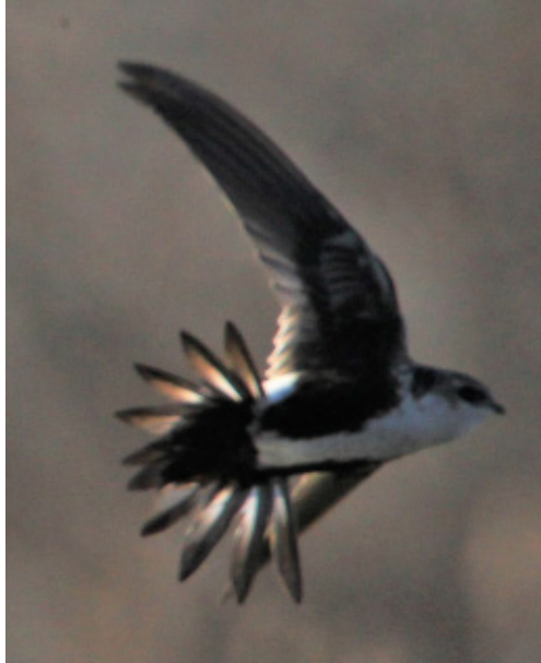
Figure 3. White-throated Swifts are fast and nimble birds while foraging, which aided in identification efforts.

The days following this sighting were exciting. Many observers were able to see the bird, some of whom traveled to Hamilton County from as far away as Michigan and New England. The White-throated Swift was last observed on 16 January 2021. This record was accepted by the Tennessee Bird Records Committee as the first record for Tennessee (Gerdeman, 2021).