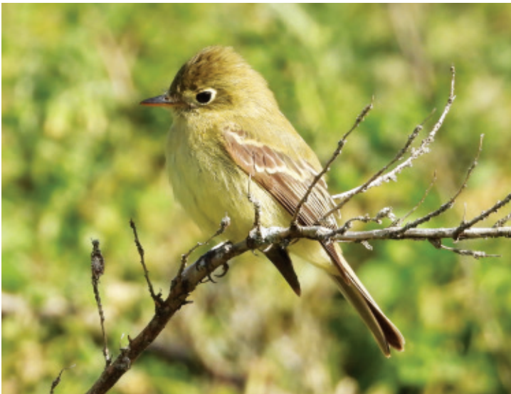
Figure 1. Observations and pictures for the Tennessee state record for Pacific-slope Flycatcher showed excellent field marks although a recording of vocalizations confirmed the species.

The noted field marks and subsequent photographs indicated to several local experts, including Doug Raybuck, that the bird was either a Hammond's ( Empidonax hammondi ) or Pacific-slope ( Empidonax difficilis )/Cordilleran ( Empidonax occidentalis ) Flycatcher.