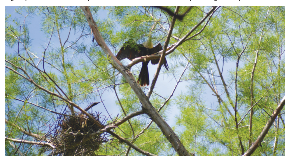
Figure 1. Anhinga tending to a nest at Meeman-Shelby Forest State Park in Shelby County, Tennessee.