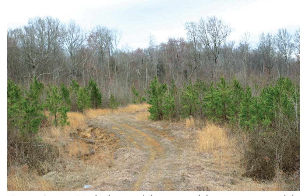
Figure 3. American Woodcock nesting habitat contained dense vegetation around the immediate vicinity of the nest.

The American Woodcock nest consisted of a ring of dead plant materials around a slight depression in the ground. It was located 0.5 m from the base of a 3 m tall Loblolly Pine on a ridge that sloped gradually to the west. Dense vegetation that was almost impenetrable to humans surrounded the nest. The most conspicuous hardwoods near the nest were Yellow Poplar ( Liriodendron tulipifera ), Red Maple ( Acer rubrum ), Black Cherry ( Prunus serotina ), Sweetgum ( Liquidambar styraciflua ), and oak ( Quercus spp. ) The ground cover included Japanese Honeysuckle ( Lonicera japonica ), blackberry ( Rubus sp. ), greenbrier ( Smilax sp. ), and Virginia Creeper ( Parthenocissus quinquefolia ). Cleared field roads and fire lanes, most of which were planted with grasses and legumes, traversed the rolling hills of the farm; the cleared areas were used for courtship displays by male American Woodcock (Figure 3). The nest was approximately 40 m from the nearest field road. Moist woodland feeding sites for American Woodcock were located within 100 m of the nest. The nest was located at 36.196761 N, 88.552519 W; the elevation was 146.7 m above mean sea level.