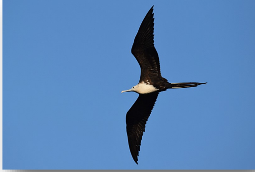
Magnificent Frigatebird Panama City, Panama (Left) Tropical Kingbird, Gamboa, Panama (Below)