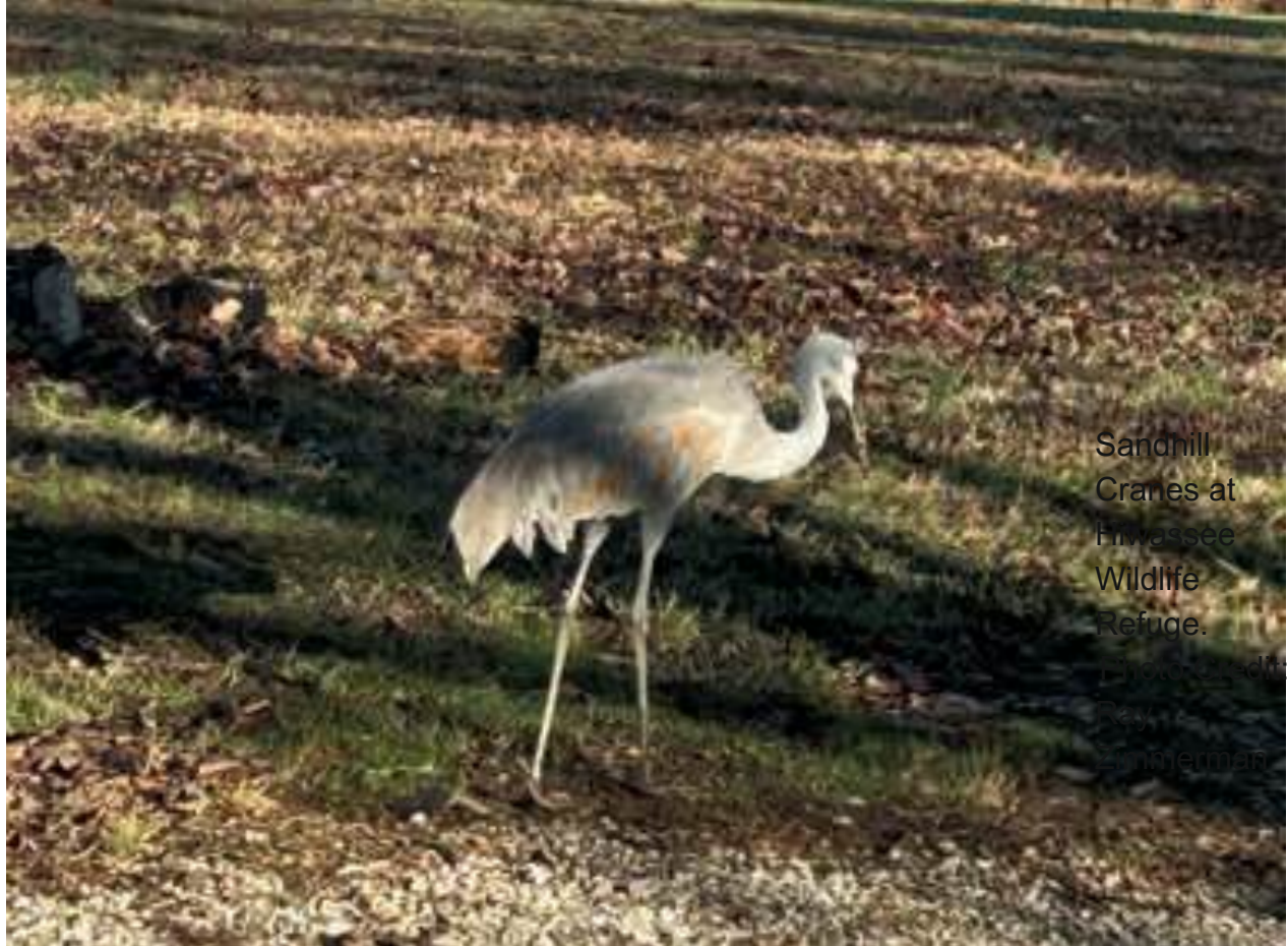
Sandhill Cranes at Hiwassee Wildlife Refuge.