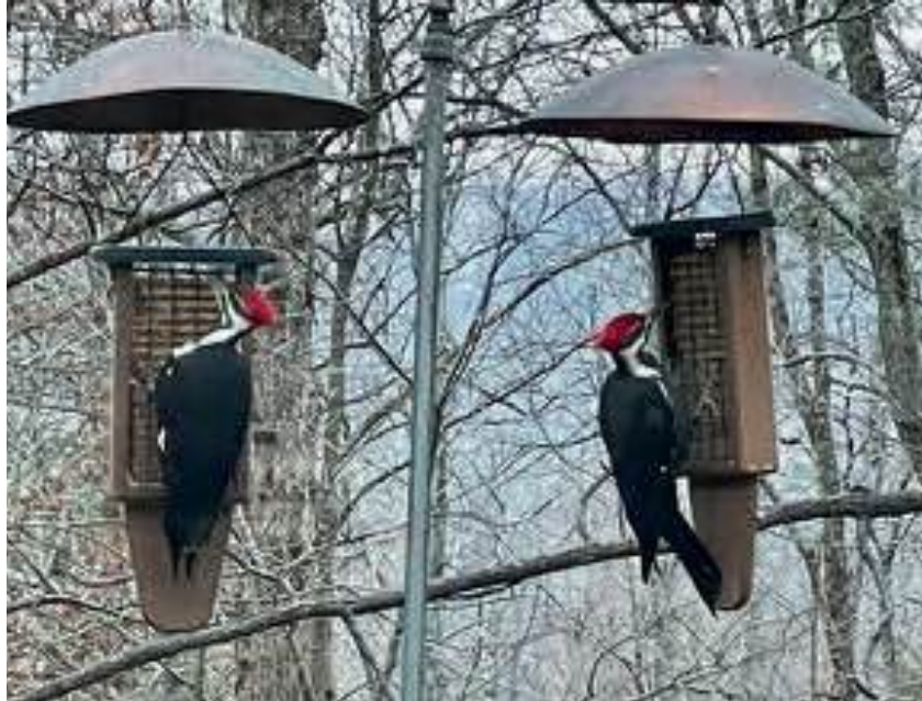
Pileated Woodpeckers. Photo Credit: Clyde Blum, taken in his backyard. January 2024

CHATTANOOGA CHAPTER OF THE TENNESSEE ORNITHOLOGICAL SOCIETY