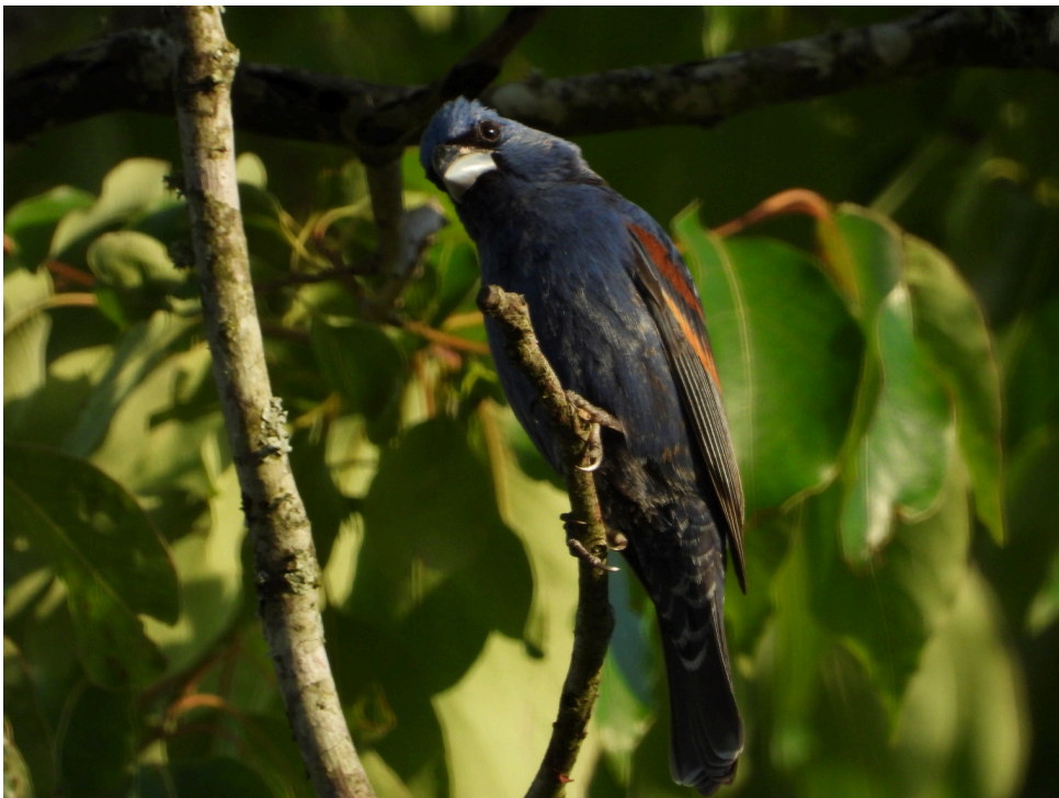
Blue Grosbeak

I want to thank everyone who helped with this count!