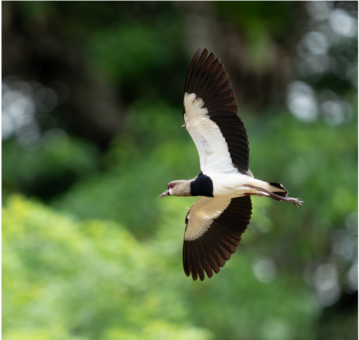
Southern Lapwing (in Panama)

CHATTANOOGA CHAPTER OF THE TENNESSEE ORNITHOLOGICAL SOCIETY