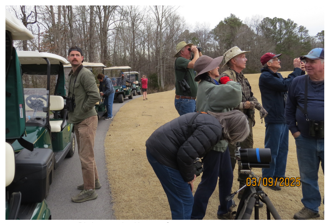
Birders at the Honors Course