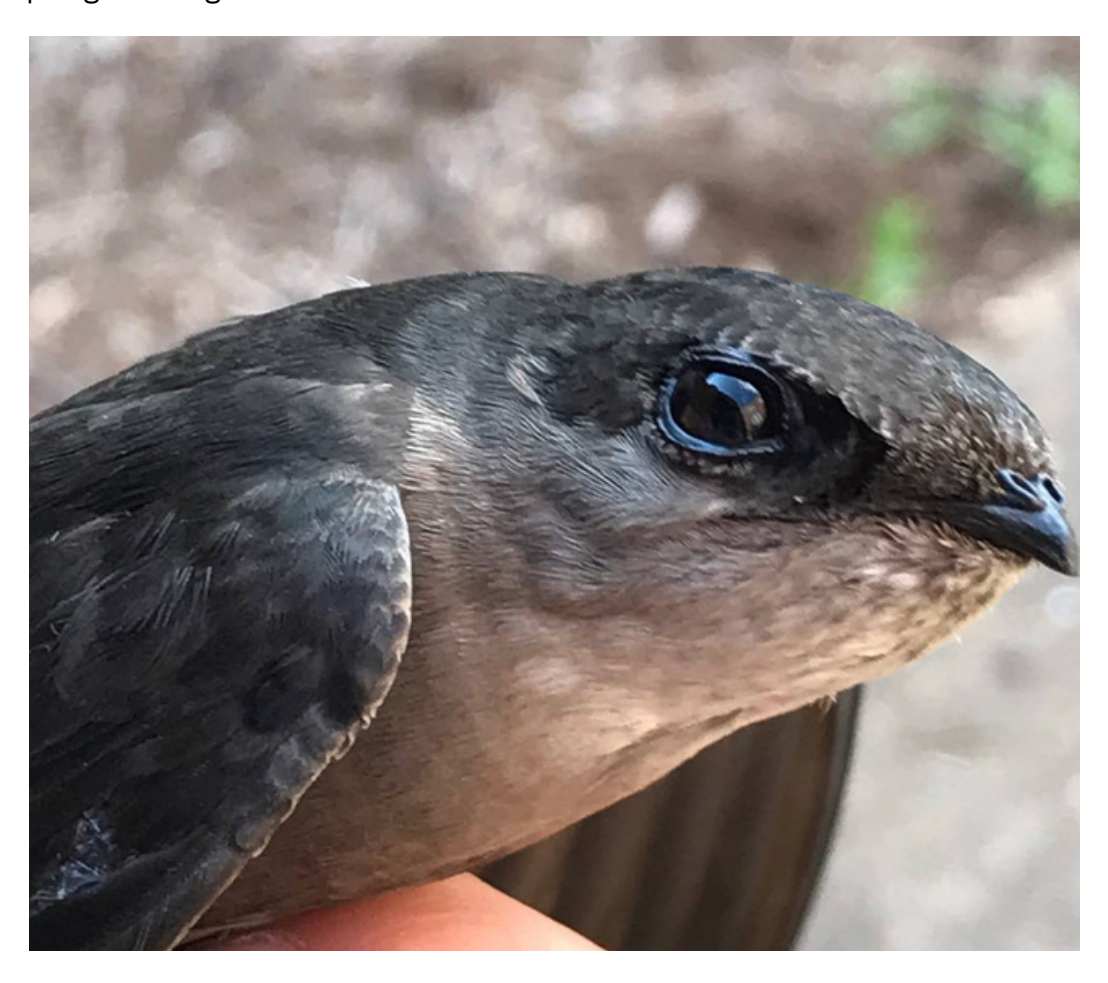
Chimney Swift

I wish everyone a fabulous spring birding experience, and I look forward to seeing you at the Spring Meeting.