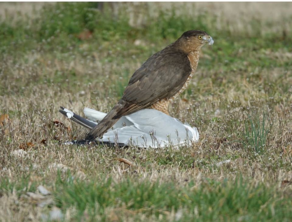
Figure 2. Over a few minutes, the Cooper's Hawk managed to overcome the Ring-billed Gull.