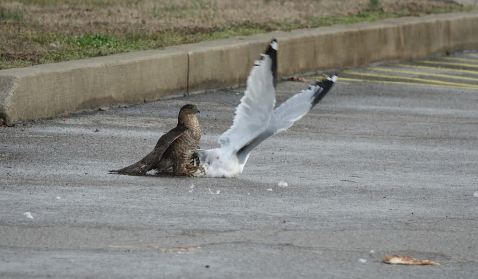
Figure 1. A Cooper's Hawk attacking a Ring-billed Gull at J. Percy Priest Dam parking lot in Davidson County.