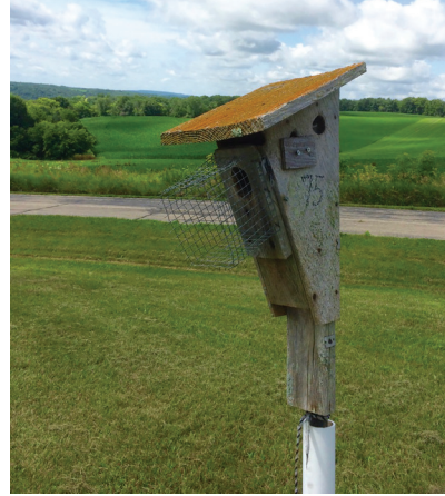
Figure 2. The Eastern Bluebird box in Black Earth, Wisconsin where the nestling banded in Nashville nested in 2016 as an adult.

In northern regions, Eastern Bluebirds migrate south for the winter, or are considered partial migrants with some birds migrating further south when food supply or winter weather conditions require (Gowaty and Plissner 2020). In Tennessee bluebirds are considered permanent residents, usually staying near areas where they hatched, and do not migrate south for the winter (Pitts 2011). To our knowledge, there are no records of resident bluebirds here emigrating north to nest. This exciting story of an encounter of one of our banded birds by an enthusiastic bluebird bander in Wisconsin inspires us to keep studying birds and reminds us there is so much more to learn.