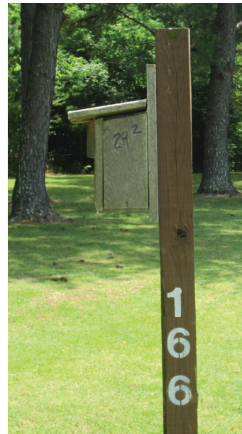
Figure 1. An Eastern Bluebird box at Percy Warner Golf Course in Nashville where the nestling was banded.

On 2 May 2016, #2251-20687 was captured by licensed bird bander Ann Wick. This female was incubating six eggs in nest box #75 in Black Earth, Dane County, Wisconsin (43.14138°, -89.70797°. Figure 2) approximately 822 km (511 miles) NNW of Nashville. At this time she was 5 years, 10 months old. The oldest known Eastern Bluebird lived 10 years, 6 months (USGS 2021), although most bluebirds (50 percent of adults, 75 percent of young) will die during a typical year (Pitts 2011). Five of the six