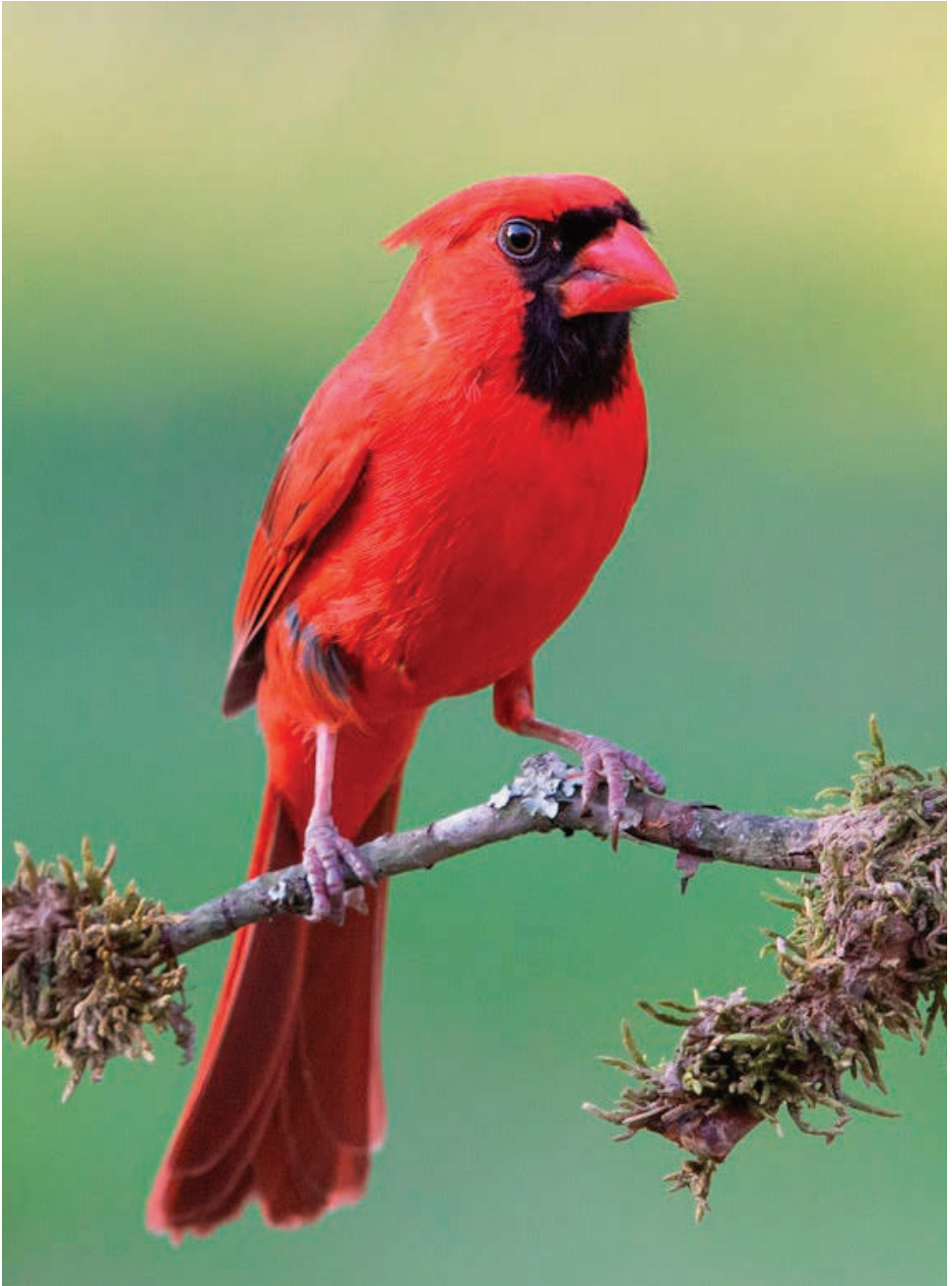
Northern Cardinal ( Cardinalis cardinalis). Shelby County, Tennessee.