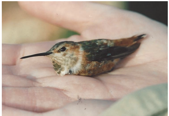
Figure 1. Tennessee's first recorded Allen's Hummingbird arrived, Hamilton County, 30 October 1993. Picture previously unpublished.