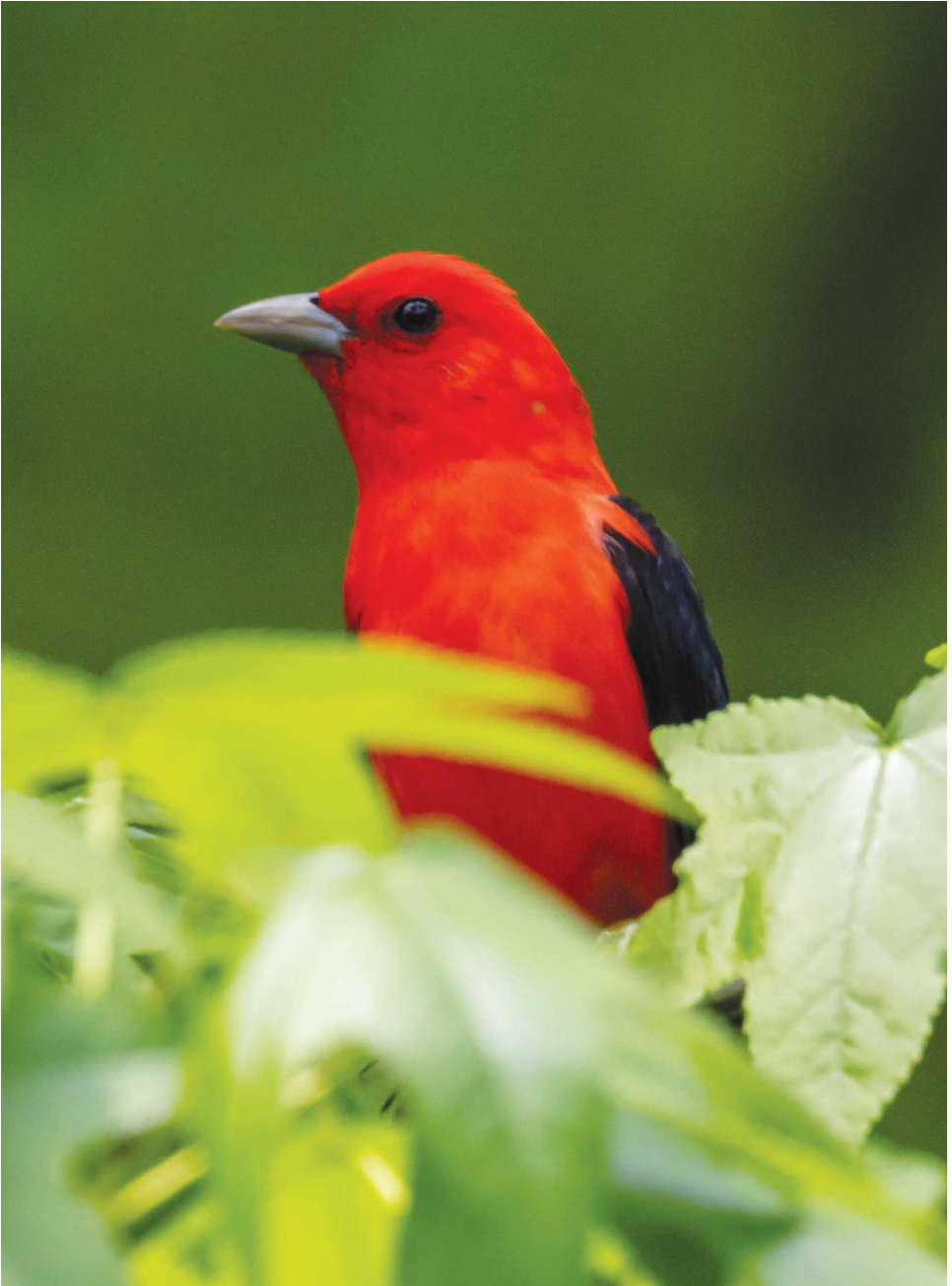
Scarlet Tanager ( Piranga olivacea). Pickett County, Tennessee.