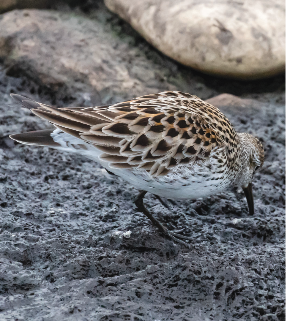
White-rumped Sandpiper ( Calidris fuscicollis ). Blount County, Tennessee.