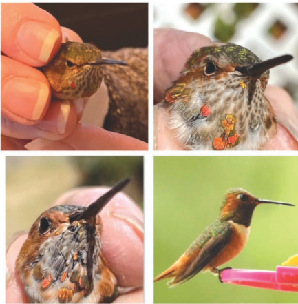
Figure 2. The Allen's Hummingbird was first banded in Lincoln County Tennessee 8 December 2020 (upper left); moving clockwise, the next photograph is the first recapture in Mobile County, Alabama (28 December 2020), the next is the recapture of the same bird in Mobile County, Alabama (20 February), and the final photograph lower right is the same bird returned to Lincoln County, Tennessee 25 August 2021.