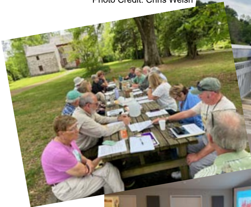
Outdoor Board of Directors meeting Photo Credit: Chris Welsh

Field trip at Seven Islands led by Kirk Huffstater Photo Credit: Chris Welsh